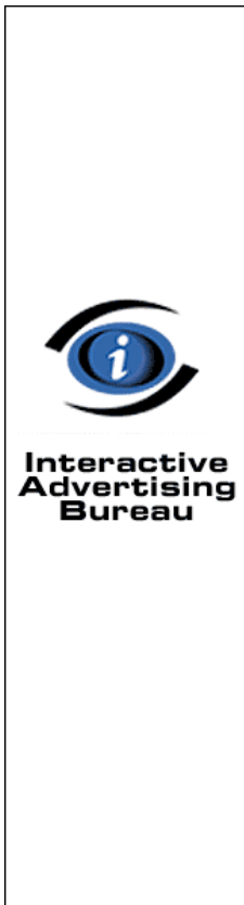
160x600 - Wide Skyscraper